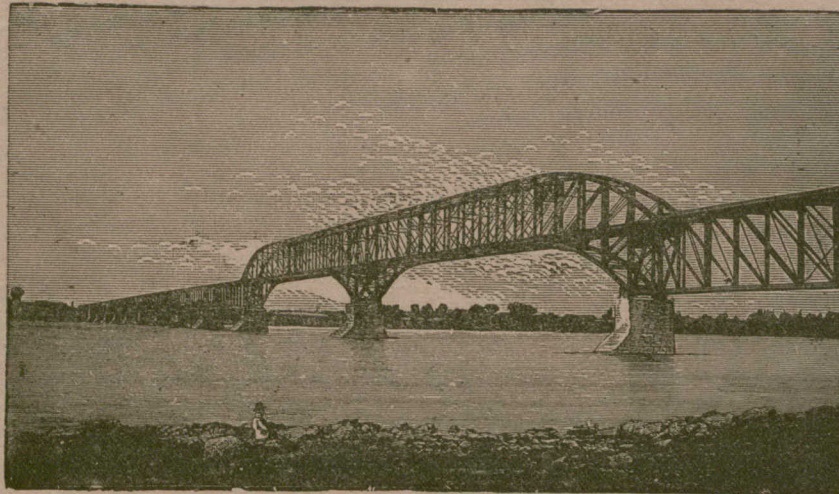
ST. LAWRENCE RIVER BRIDGE, CANADIAN PACIFIC RAILWAY, LACHINE, P. Q.

For Railways and Highways, Iron Bridges, Turntables Iron Piers and Trestles Bridge Rods Right and Left Hand Sleeve Nuts and all kinds of Structural Iron Work.