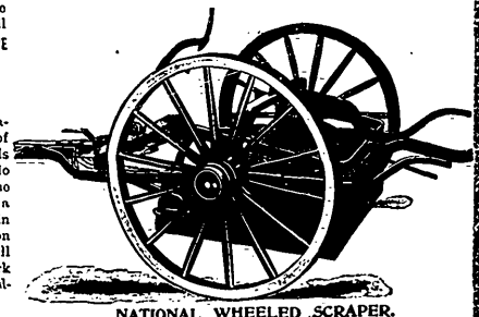
NATIONAL WHEELED SCRAPER.

We warrant this Machine to save 75 cent. of the cost of making roads in the old way; to do its own plowing in the hardest soils; to make a ditch 21 inches deep in any soil in fit condition for plowing; and to fill ditches and do all work that any other Road-Machine will do.