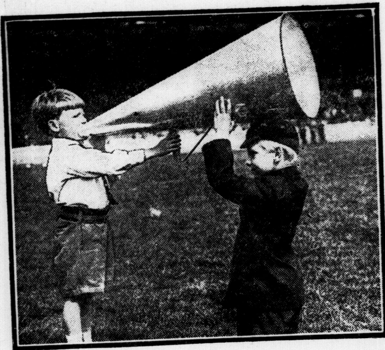
Youthful announcer for the juvenile events at the old London police athletic meet.