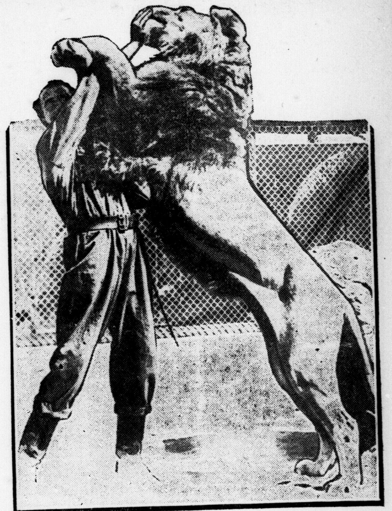
The lion may be tame, but there appears to be a considerable element of danger. The photo comes from California.