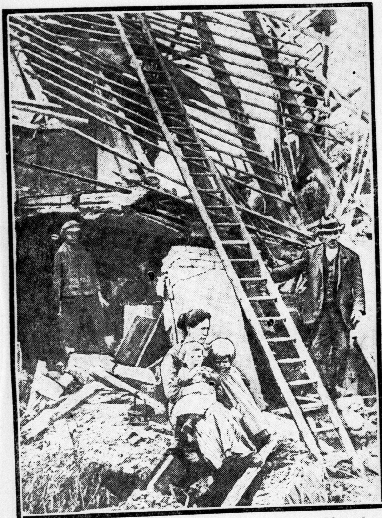
Scene amid the ruins after a cloudburst in Germany. Many families were rendered homeless and scores were injured.