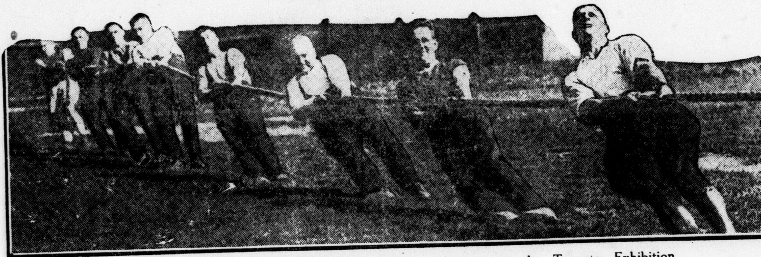
The Toronto police force tug-of-war team, a doughty competitor at the Toronto Exhibition tussles.