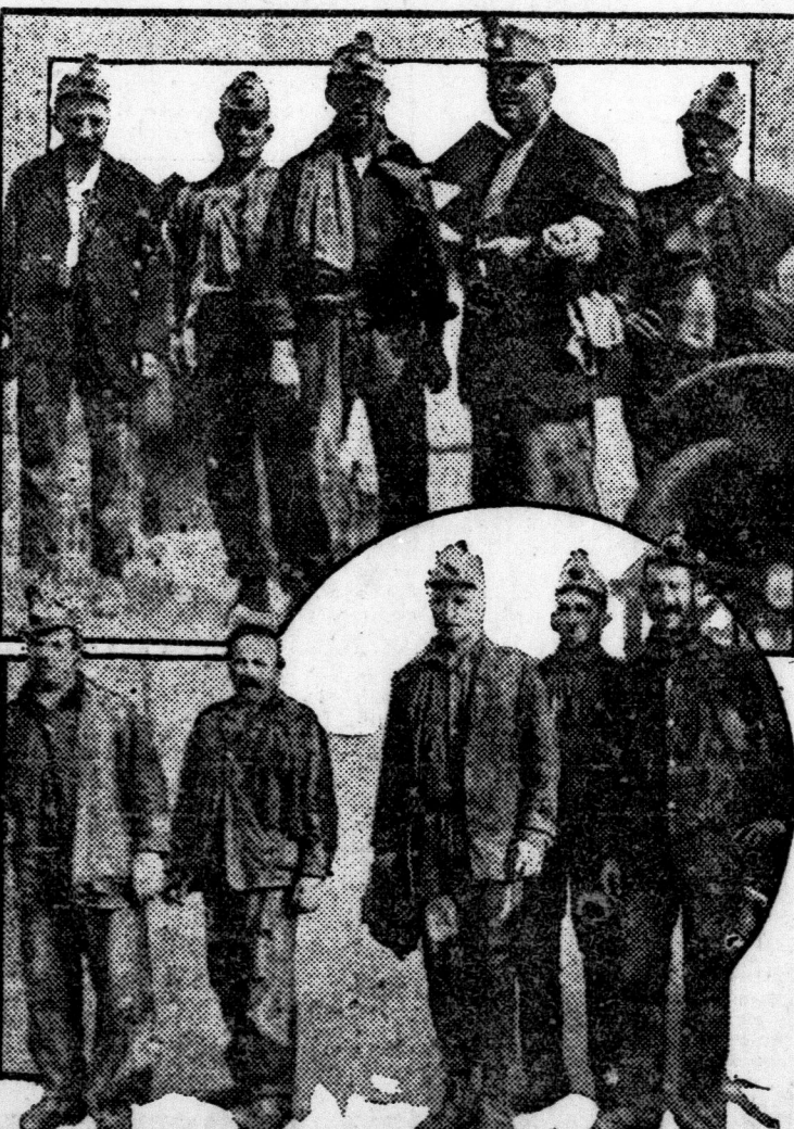
Heroic Efforts of No Avail.

THE rescue crew, who "broke through" to the section of the Argonaut mine in Jackson, Cal., where 47 miners were entombed for three weeks, only to find their comrades dead. As a result of their brave efforts, the crew of 30 wins $5,000.