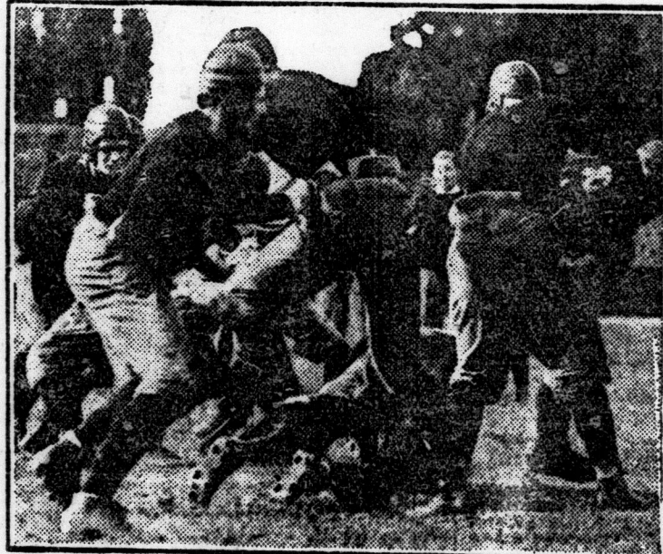
Just a Friendly Little Mix-up.

HERE'S a little practice scrimmage for the linemen at Princeton, N. J., just rough enough to give the fellows a little hardening for what's to follow in the coming season. Instruction in preliminary tactics for this season's grid team has been going for some weeks back.