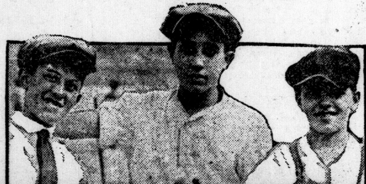
Tenement Boys Tennis Champs.

THESE youngsters, who live in a tenement district of New York, indulge their tennis proclivities by stretching a net across the street for a court and making wooden paddles for racquets.