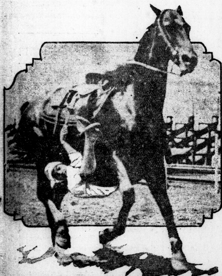
Champion Woman Trick Rider.