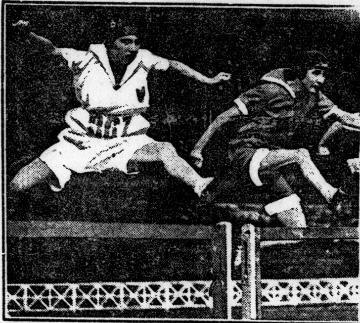
Allies Go Over the Top Again.

AGAIN the British and French go over the top together. But this time it is in an international women's athletic meet in Brussels. Miss Lines, British contestant (left) secured the hurdle honors. Much prowess was exhibited by the fair contestants in the various athletic events on the Cincepad program, which included all the different lines of sport.