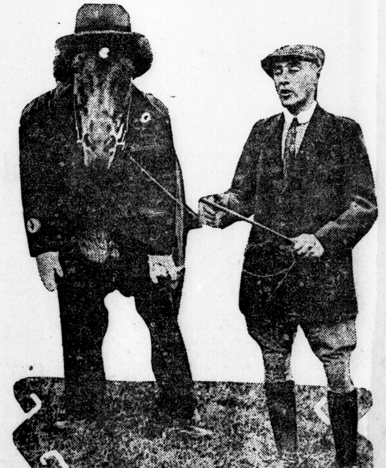
Dobbin, Out of Work, Dolls Up.

SINCE autos and tractors are doing a great deal of the work formerly done by horses, Dobbin has had more time to spend on his personal attire. Here's Gee-Gee dressed up as Charlie Chaplin, escorted by his owner, at the Barnet (England) Fair.