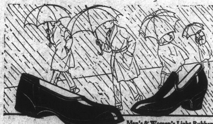
Men's & Women's Light Rubbers

Buy the Hi-press Brand and get the BEST for your money