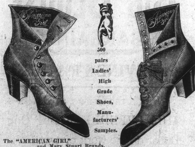
The "AMERICAN GIRL" and Mary Stuart Brands.

Regular $3.50 to $5.00 Values. Your Choice for $2.50.