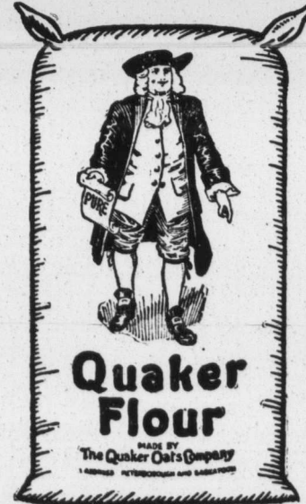
A product of The Quaker Mills, Peterborough and Saskatoon

Sometimes your home-baking does not turn out quite so well as usual. A variation in the quality of the flour will cause trouble.