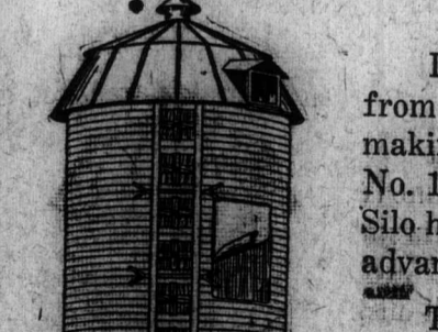
NICHOLSON THREE-WALL SILO (Patented)

The Nicholson Three-Wall Silo is the most recent invention in Silo construction. It has three distinct walls. The outside 1-2 "B.C. Fir wound from top to bottom of the Silo."