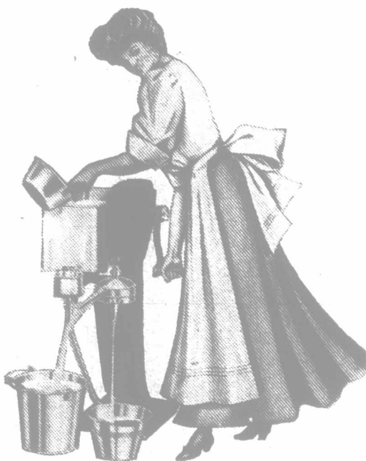
The top of the supply can, on the largest dairy Tubular, is only 3 feet 3 inches above the floor. Easy to fill, steady, need never be moved to take out the bowl. An exclusive Tubular advantage.

Tubulars run remarkably easy because they