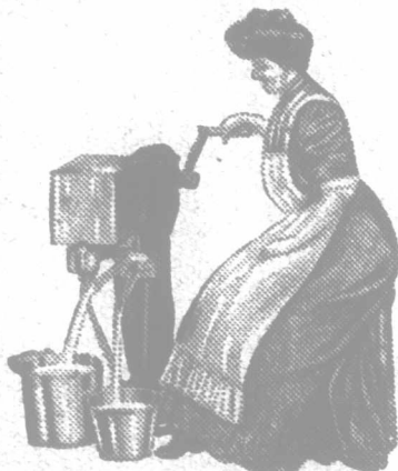
The light Tubular bowl, hung from a single frictionless ball bearing, and driven by self oiling gears makes Tubulars so light running that the medium size can be turned by one who is seated.

The few, simple running parts are all enclosed in a dust proof case in the head of the Tubular. They are entirely self oiling, needing only a spoonful of oil poured right into the gear case once a week. The gear case cap lifts off without unfastening anything. This makes Tubulars very neat. Your wife will appreciate that, and also the light, quickly washed dairy Tubular bowl which contains one tiny, instantly removable piece, very much like a napkin ring in shape and size.