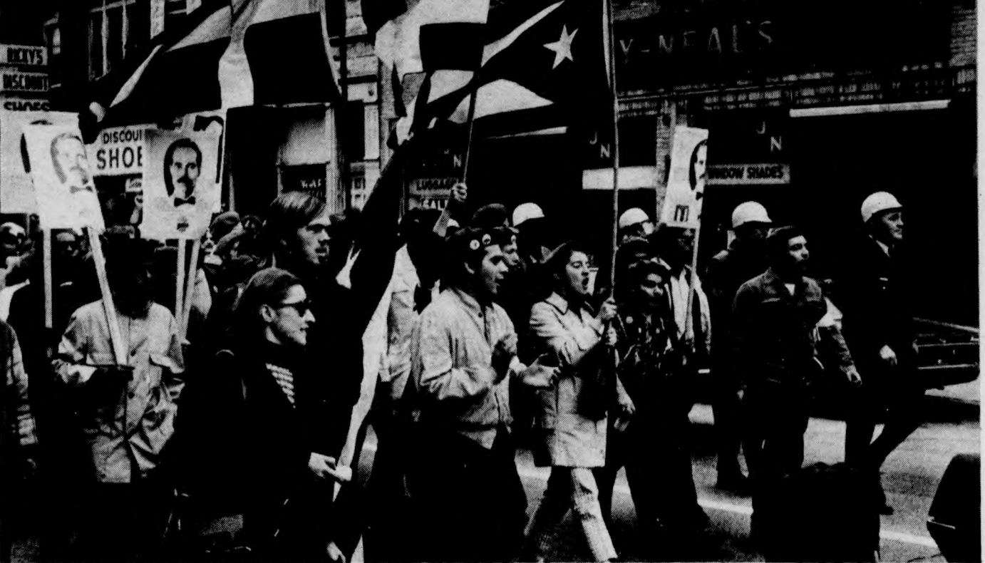
The marchers meandered on, down Armitage Avenue, through the Latin area, toward Humboldt Park.

down Armitage Avenue, flanked by the double file of Chicago police, led by about 20 more and followed by the convoy of paddy wagons and squad cars.