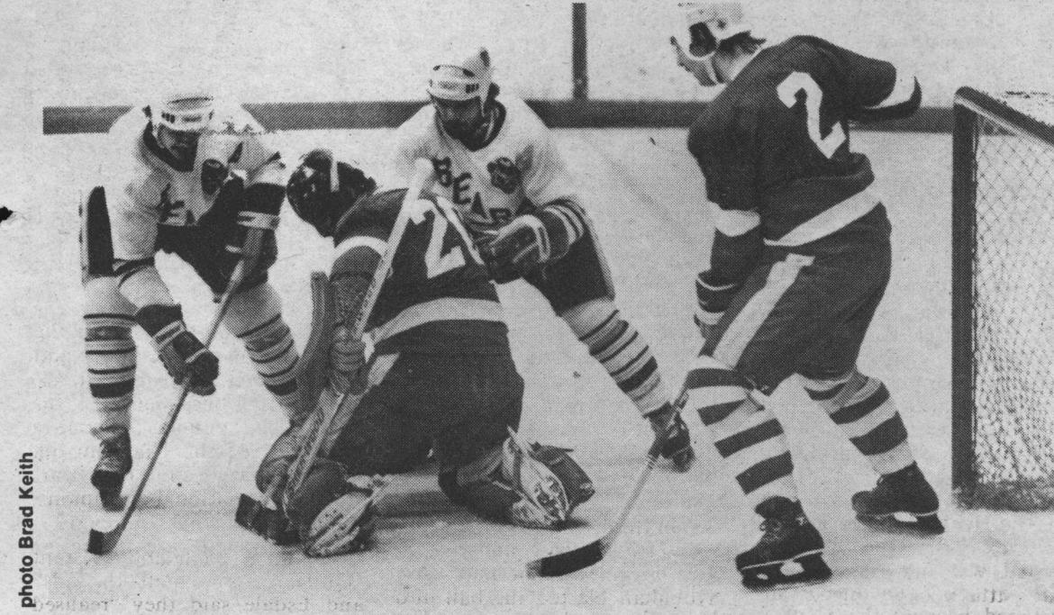
The Huskies won't be eating scraps this year because they have an improved team.