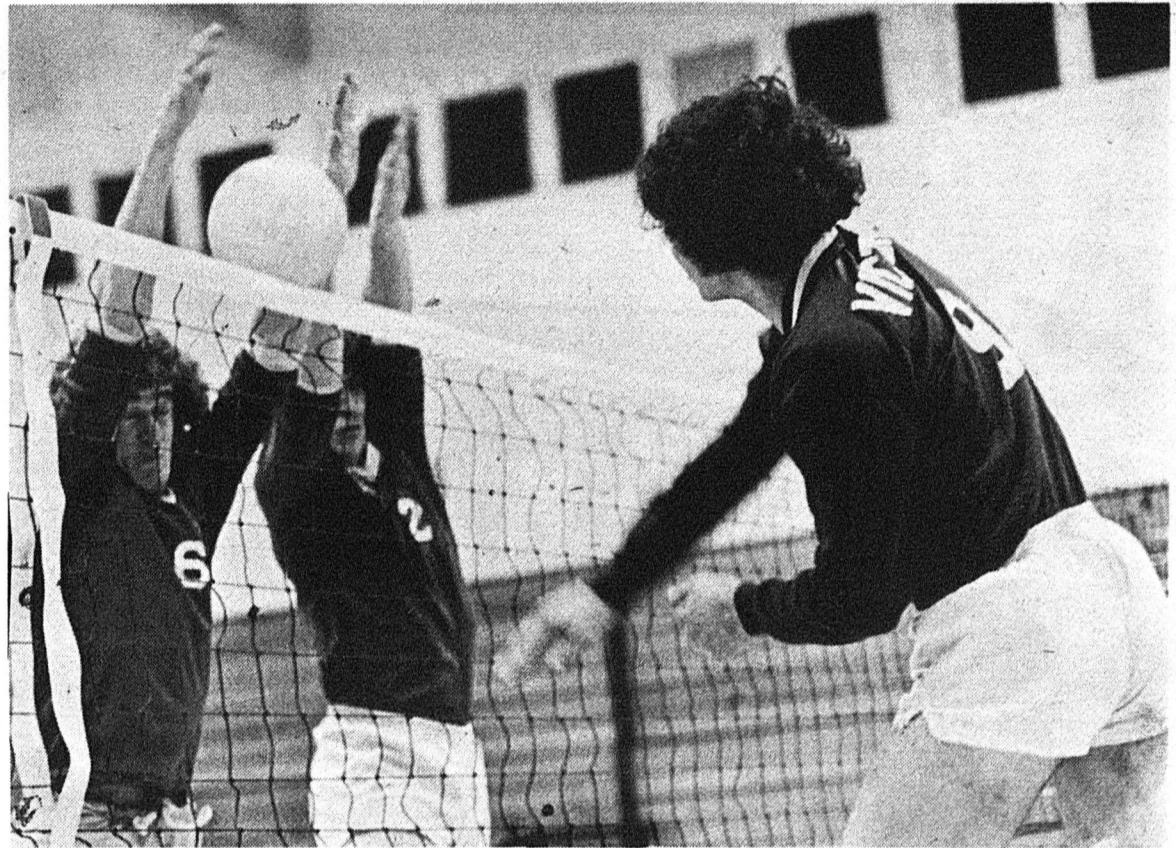
Vikings missed this block on Bear spike.