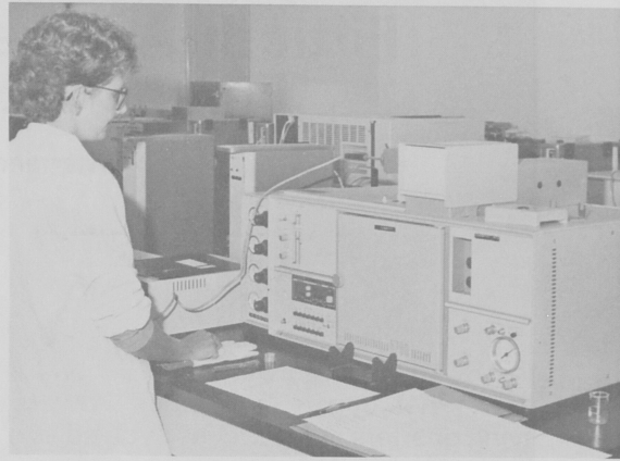
Arson debris undergoing chromatographic analysis (Chemistry Section).