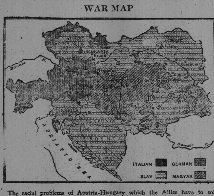
The racial problems of Austria-Hungary which the Allies have to solve. The Slavs of Bohemia and Moravia make up the new Czechoslovak state. The Poles of Galicia may join their brothers in the north to form an independent Poland. A group of Slav states in the lower centre of the map may join with Montenegro and Serbia to make up a great Jugo-Slav nation.