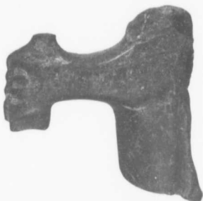
No. 6. Victoria Co., Ont.

This pipe is called the "Dragon Pipe," but is, no doubt, a well-finished animal pipe of type figured in figure 19, etc., Ontario Archaeological Report, 1902. Has small ears, large eyes and large pronounced jaws, mouth and teeth. The legs are well-executed; the hind ones being inversed and the front toes are denoted. The tail (or frontal bar), being produced to the chin; and also has a number of slots cut into it, a rather unusual condition. The bowl and stem-hole are in the usual positions seen in this type. This pipe is spoken of as being an extremely rare type in the upper Mississippi Valley.