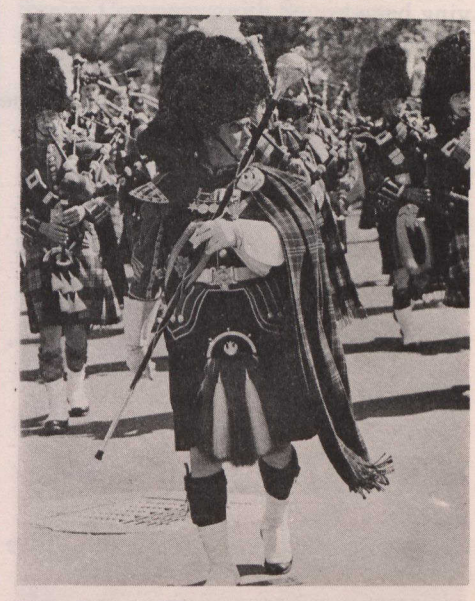
The City of Winnipeg Massed Pipes and Drums were part of the All-Canada Pipe Band marching in the Parade.

Highland pipers - 150 of them - formed the All-Canada Pipe Band in