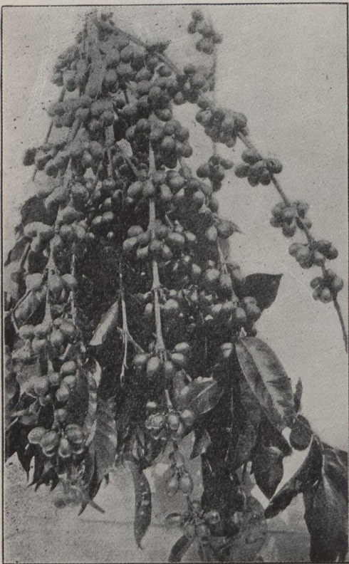
BRANCH OF COFFEE TREE