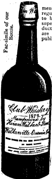
Fac-simile of our Bottle.

Try our Genuine Imported Light Wine at $2. splendid dinner wine.