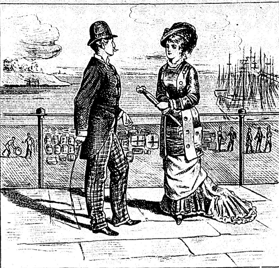
MONTREAL:—ALONG THE RIVER SIDE.

No. 1501, St. Antoine St., Montreal. A large assortment of Coupés, Drolers, Victoria Phaetons, Rockaways, T. Carts, Buggies, and all kinds of Family Carriages on hand, cheap. Repairs promptly attended to. 16-13-52-391