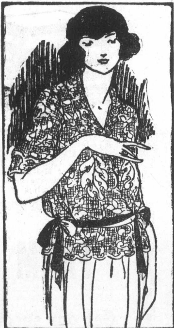
Smart Blouse of Chantilly Lace.

As a rule, the French-designed skirts are very short and tight, with elaborate over-drapings. A drapey that flares on one hip only is a favorite. The really dressy separate skirt will almost certainly be in great demand during the coming fall and winter, due to the fact that the elaborate