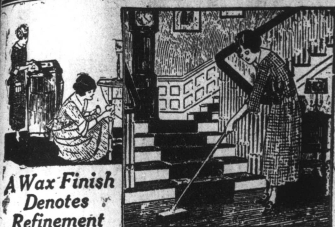
A Wax Finish Denotes Refinement

THE LAND WHERE FABULOUS WEALTH AWAITS RECOVERY. When, towards the middle of the sixteenth century, the Spaniards conquered Peru, the greatest treasure in gold and silver that was ever collected was lost to the world.