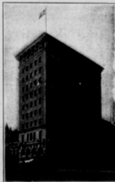
Head Office, Winnipeg

SASKATCHEWAN—Adanac, Alask, Arcola, Asquith, Bounty, Buchanan, Calvi, Canora, Carlyle, Craik, Cupar, Cut Knife, Esterhazy, Eyebrow, Fillmore, Gravelburg, Gull Lake, Herbert, Humboldt, Indian Head, Jansen, Kinderley, Kerr Robert, Landis, Lang, Lanigan, Lemberg, Lussenden, Luss Land, Macklin, Maple Creek, Maryfeld, Milestone, Moose Jaw, Moonbeam, Nether Hill, Neudorf, Ogema, Outlook, Oxbow, Pense, Perdue, Plenty, Qu'Appelle, Regina, Rocanville, Rosetown, Saskatoon, Scott, Strassburg, Swift Current, Simpson, Sintaluta, Southey, Tessier, Theodore Togo, Tompkins, Vanguard, Viceroy, Wapella, Watrous, Webb, Weyburn, Wilkie, Winthorst, Wolsley, Yorkton, Zealandia. ALBERTA—Airdrie, Aile, Barons, Bashaw, Bassano, Bellevue, Blackie, Blairmore, Bowden, Bow Island, Brooks, Calgary, Carbon, Cardston, Carleton Place, Claresholm, Cochrane, Consort, Cowley, Didsbury, Edmonton, Fort Saskatchewan, Grande Prairie, Grassy Lake, High River, Hillcrest, Innisfail, Irvine, Lacombe, Langdon, Lethbridge, Macleod, Medicine Hat, Okotoks, Passburg, Fincher Creek, Seven Persons, Strathmore, Swallow, Three Hills, Wainwright.