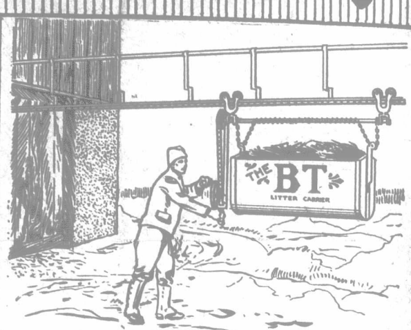
Glides along overhead track, right over mud or snowdrifts. Job's done in a jiffy.

In the fall when the yards are muddy and in winter time when drifts are deep, it's hard work getting the manure out from the barn with a wheelbarrow or stoneboat. Stable-cleaning is then a drudgery. And the manure is bound to accumulate in and around the stable, rotting the woodwork, and impairing the health of the stock.