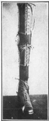
SUPPORT FOR A PARALYSED LEG.