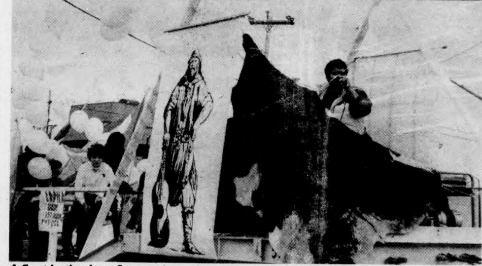
A float in the Jane St. parade.

He said he was not bothered by the groups who op-