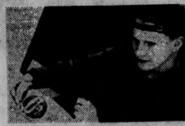
Detective Chuck is on the ULTRA™ Case — Page 18