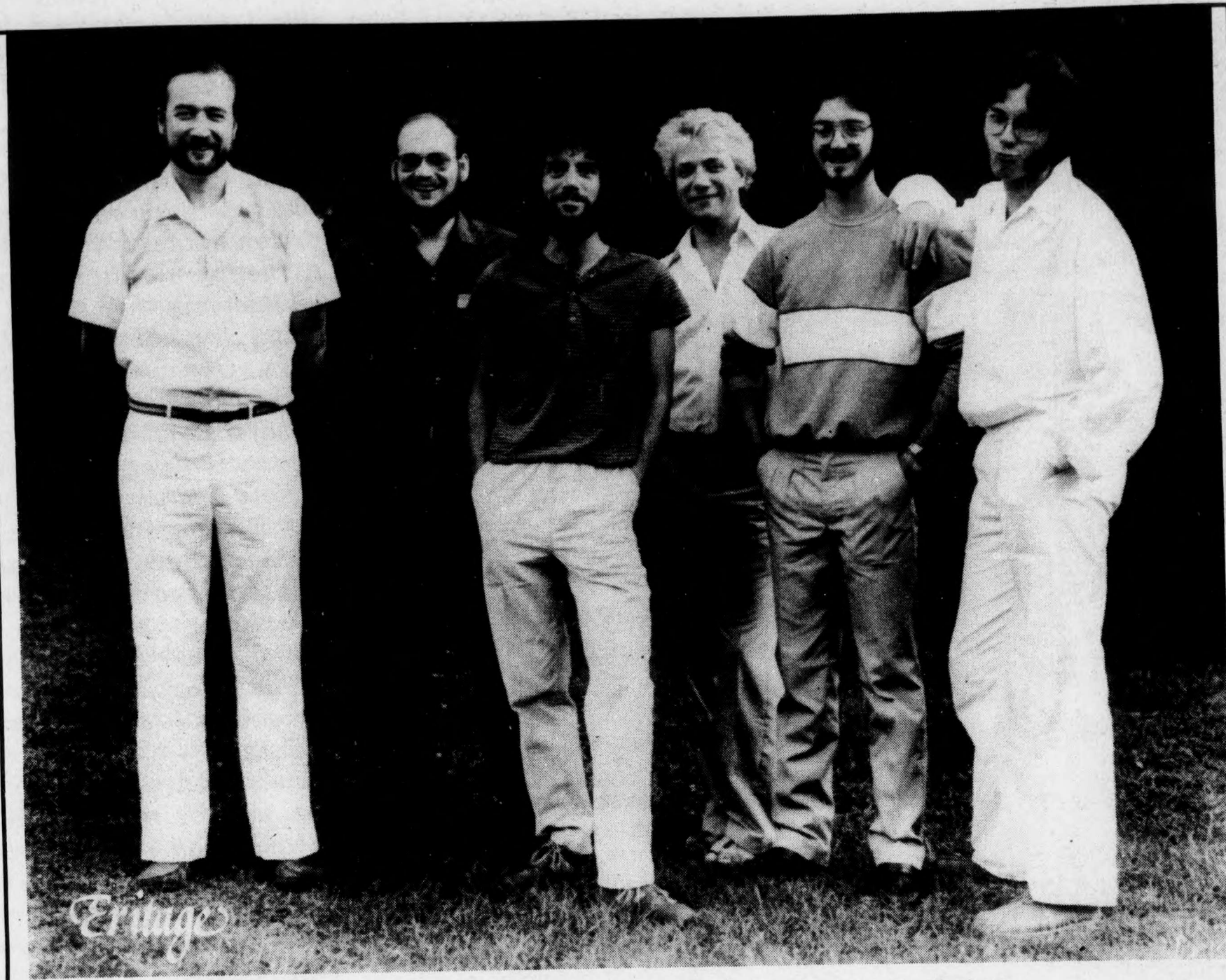
Eritage , a "foot-stompin' Quebec folk singing group, is to appear at the Playhouse, Wednesday, October 3 at 8 p.m.

"To start off one of these dance numbers a band member would count off, '...trois, quatre' and the button accordion and fiddle would spinout the rapid joyous lines in unison. Gradually piano,