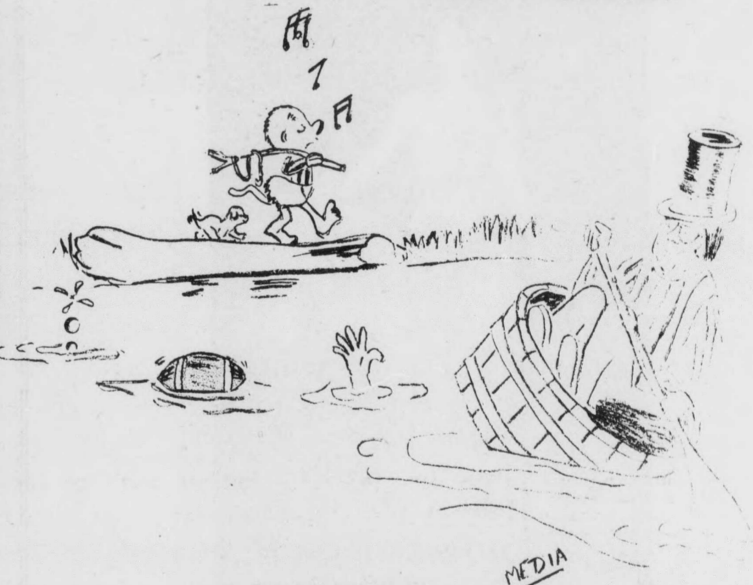
THE BRUNS AND CHSR WISH TO THANK HOWIE FOR REFFING THIS YEARS NUB BOWL

No Reservations Mon- Fri- 10:00- 9:00 Necessary Sat - 10:00- 5:00 454-5222