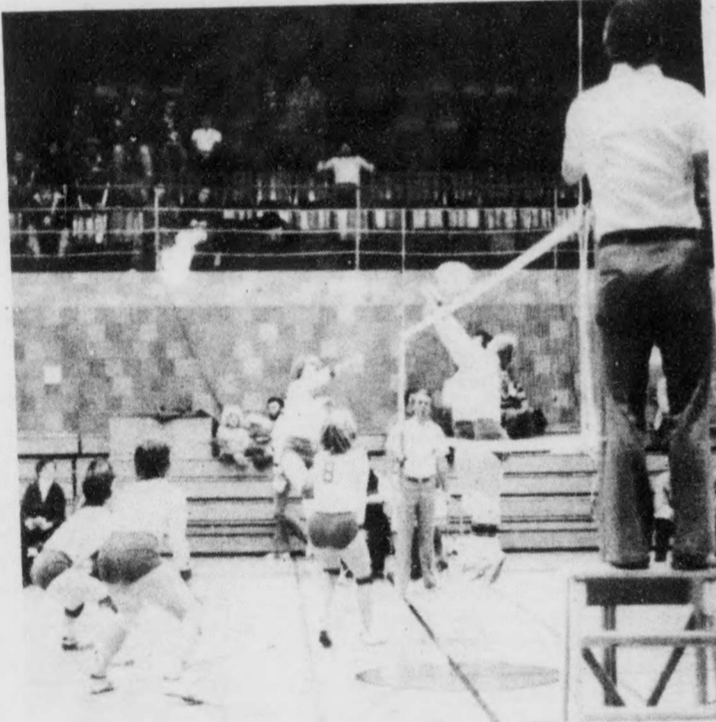
The Reds also won at Laval this weekend in a similar towney to that which the Rebels won.

It appears now, that if the Rebels continue to play as they did last Saturday, they will be the ones representing the Maritimes at the nationals at the end of this month.