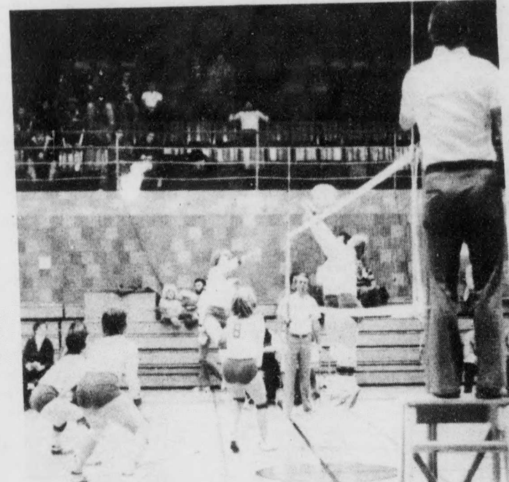
The Reds also won at Laval this weekend in a similiar towney to which the Rebels won.

Tourney will be a definite threat with her Olympian experience and her reputation as the sixth best scorer in the national women's The X-ettes were missing three basketball world. The Red players from their line-up for the Bloomers are looking forward to the game that hopefully will make strengthened for the next meet- their Winter Carnival weekend a