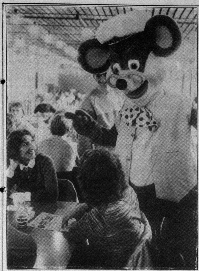
The Great Pizza Mouse