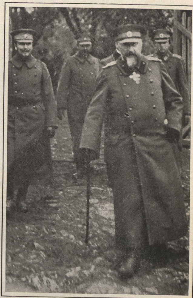
The King of Bulgaria Among His People—Taking a Stroll in the Town of Stara Zagora.