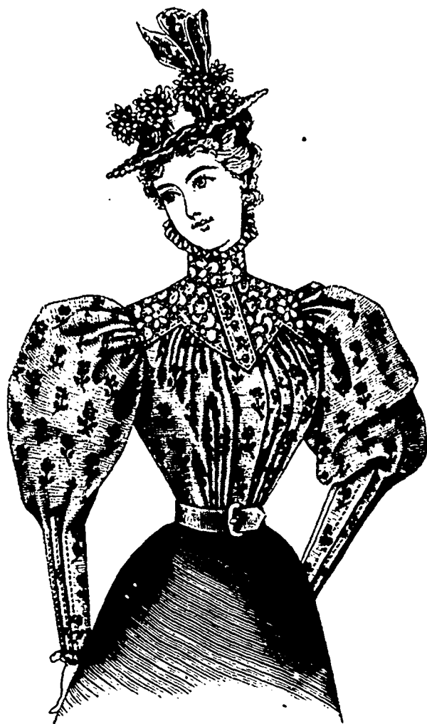
FIGURE No. 225 W.—This illustrates LADIES' SHIRT-WAIST.—The pattern is No. 9129, price 1s. or 25 cents. (For Description see Page 645.)

The vest is displayed between stylish jacket fronts, turned back above the bust in broad revers that are gracefully curved at the ends. The jacket-basque is especially desirable for stout figures, having two under-arm gores at each side. It has fulness underfolded below the waist at the side-back seams to form a box-plait at the center of the skirt. The one-seam sleeves are in the popular size with becoming fulness at the top, and the standing collar is encircled by a wrinkled stock.