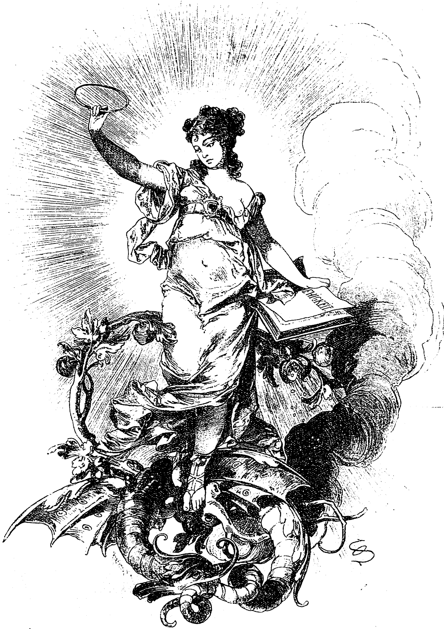
FOR EVER AND EVER.