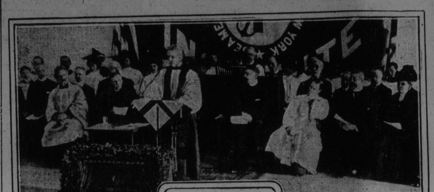
BISHOP GREER SPEAKING AT TITANIC MEMORIAL DEDICATION

Hamburg, April 22.—The new Hamburg-American Line steamship Imperator, 900 feet long, ran aground in the Elbe this morning. She was proceeding from the Vulcan shipbuilding yards for the lower Elbe to make ready for her official trial trips when she grounded off Alton. Under favorable conditions, it is hoped she can be floated tonight.