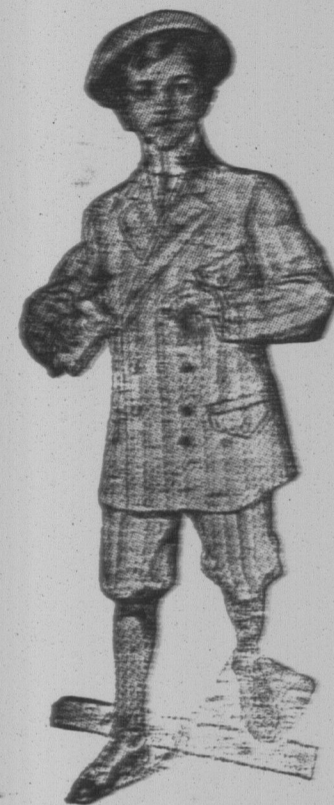
The College Suit "Lion Brand"