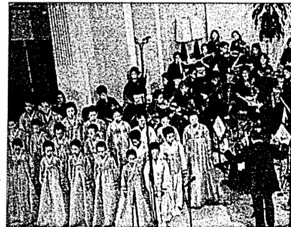
The Orchestre des Jeunes Coréens de Montréal

For information, contact festival organizers for performance times at (514) 484-5556.