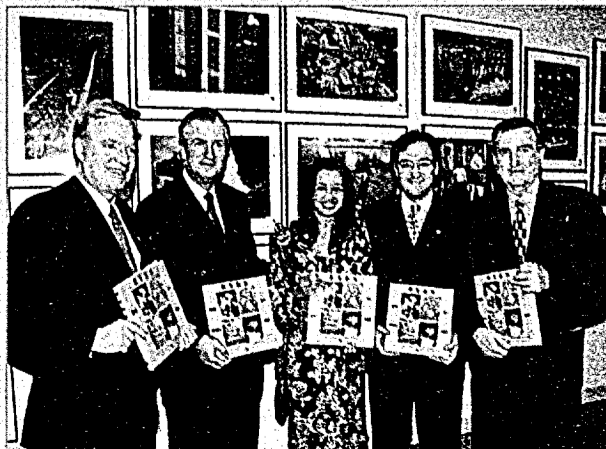
Première of "Eyes on ASEAN"

Clearly, Montreal is taking full advantage of its exposure to the Asia Pacific and the benefits of belonging to the Pacific community.