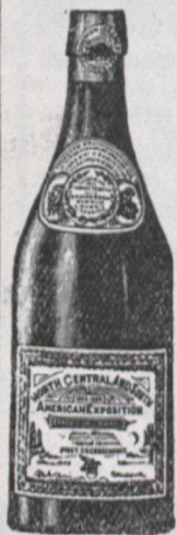
FAC-SIMILE OF WHITE LABEL ALE