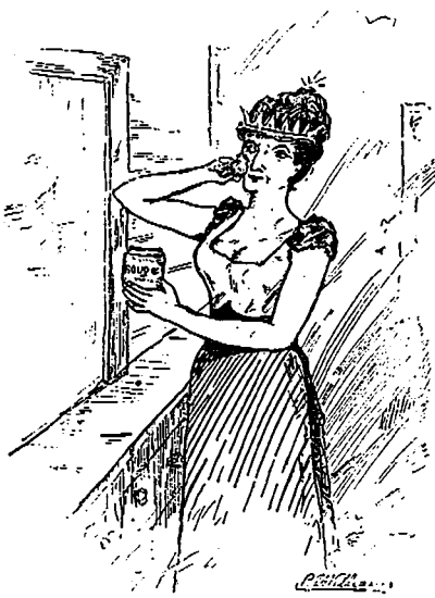
"A ROYAL FLUSH."