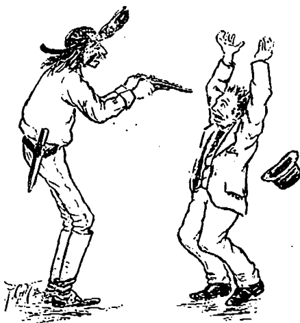
COVERING HIS MAN.

A GREAT man's misdeeds are eccentricities. An ordinary man's eccentricities are sins of the most heinous character.