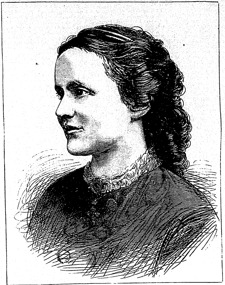
PRINCESS ELIZABETH, HIS WIFE.