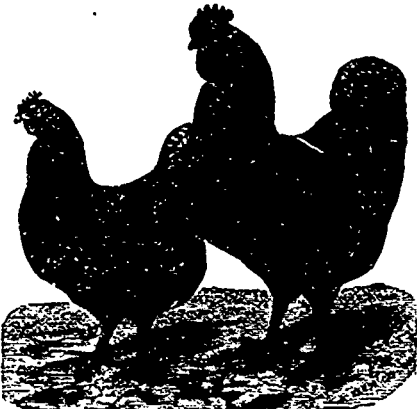
St. Francis poultry yards.