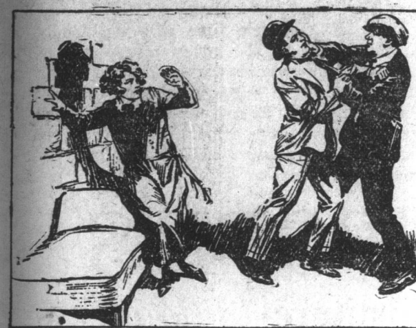
Abducted to New York's jungle of crime!

A film drama that penetrates Fashion's secret haunts revealing the adventures and perils of the beautiful models who grace the jewelled byways of Peacock Alley. You haven't seen a thriller until you see this great motion picture. It's the Big Novelty Picture of the Year!