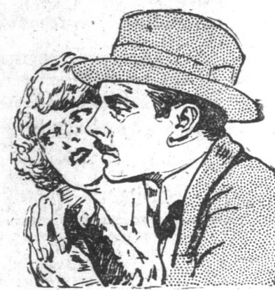
"Let me go!" she gasped.