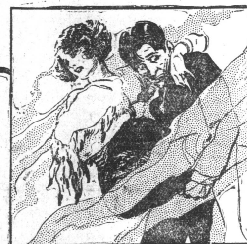
Is there no escape?

Adapted by H. H. Van Loan Scenario by Carey Wilson JUNE MATHIS, Editorial Director