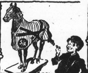
5-A BIAS GIRTH Horse Blankets Will keep their position on the horse Can't slip or slide. Tight girthing unnecessary.