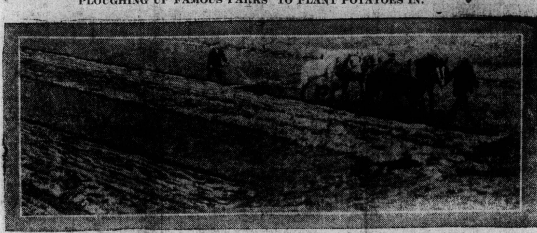
England is going to see if she cannot grow most of her own food within the Kingdom this year. To that end some of the big parks of London are being ploughed up for seeding.

Many and many and many a time upon the fern and kill it, for then the fairy, too, would die. They gnawed at the stalks and gnawed, and I suppose the witch's scheme would have succeeded, but just then the Wind came blowing along, blowing along, blowing along in a hurricane.