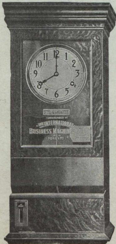
International Job Recorder

Every job or operation calls for a "job card." The workman punches the time he starts it. He again punches the time he finishes. Both records are printed on the card by mechanism inside the machine, in absolutely accurate, unchangeable figures. There you have the basis of a complete time keeping system that will keep track of actual working time and, quite as important, give you a tracer on your "expense labor time"—the working time you are paying for but not using.