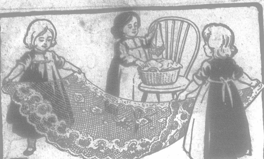
The Sunlight Maids admire the results of their work.

WANTED—A young man of last year's offer will be glad to see you at my place. Good pay. Write to me at 214 Farley Ave., Toronto.