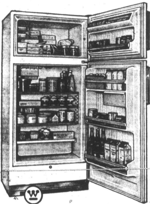
Westinghouse 13.1 cu. ft. Frost Free Refrigerator. Compact Two-door Refrigerator Model RJH30. Very accommodating. Lets you adjust the interior the way you want it! 10-position adjustable shelves, magnetic door gaskets, 124 lb. separate Frost Free freezer, full width porcelain crisper, All-purpose Egg Container. WESTINGHOUSE WHITE SALE PRICE.