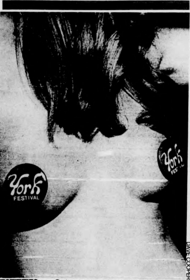
FESTIVITIES: Order your York Festival buttons made to measure. We hear the ploy was successful.

With this tale ran a photograph of two "Tunnels Rats" (disguised Excal staffers) lying in the tunnel, surrounded by essential equipment: a candle, sleeping bag, blanket, typewriter, books, ashtray and cigarettes, a kettle, and—a telephone. Few people noticed the inconsistency of a telephone in a steam tunnel, not even the Canadian Press (CP) wire service, who immediately picked up on the story and came to Excalibur to cover it.