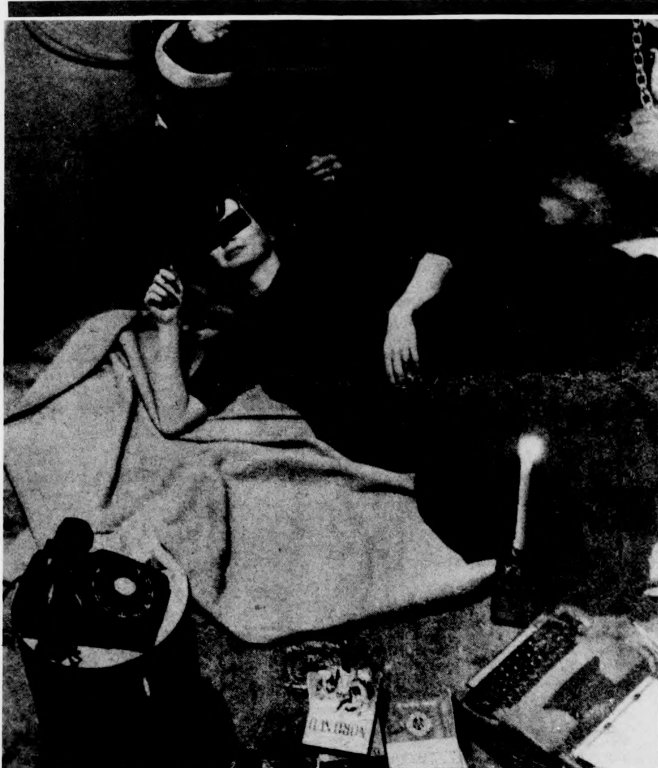
TUNNEL 'EXCALI' RATS: Ever wonder where those rumours of people living in the tunnels originated? A subsequent rumour has it that renovations imprisoned these two faithful reporters for 2 weeks without their phone books.

Excalibur is a testament to all that happened and failed to happen in the past 20 years of York University's development. While attempting to be "an agent of social change," York's Community Newspaper is foremost a reflection of those who have made its news, and those who have cared enough to print it.