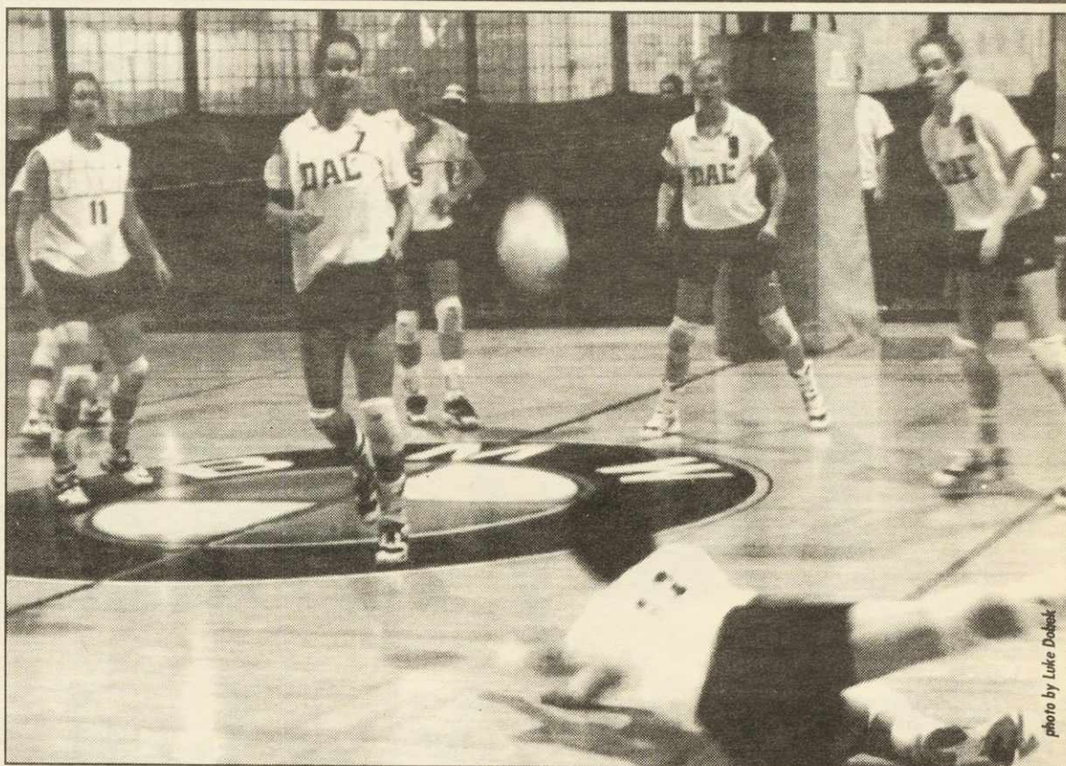
GOLDEN GIRLS: Dal women's volleyball victorious in Dal Classic.

The young squad sits 6-1 in conference action and will look to improve their standings with a match against St. FX in Antigonish on Wednesday.